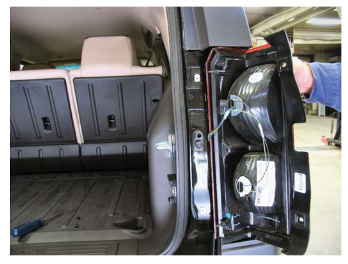
The BX8869 Bulb and Socket Taillight Wiring Kit is recommended for the HUMMER H<sup>3</sup>.

The Bx8869 Bulb and Socket Wiring Kit is recommended for this vehicle.