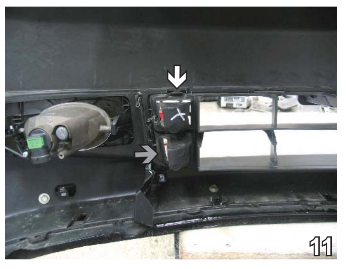
11. On the driver's side, mark the upper air vent flush with the back side of the grille opening. Using the utility knife, trim the marked area. Some models may need to have the lower air vent removed also (see gray arrow).