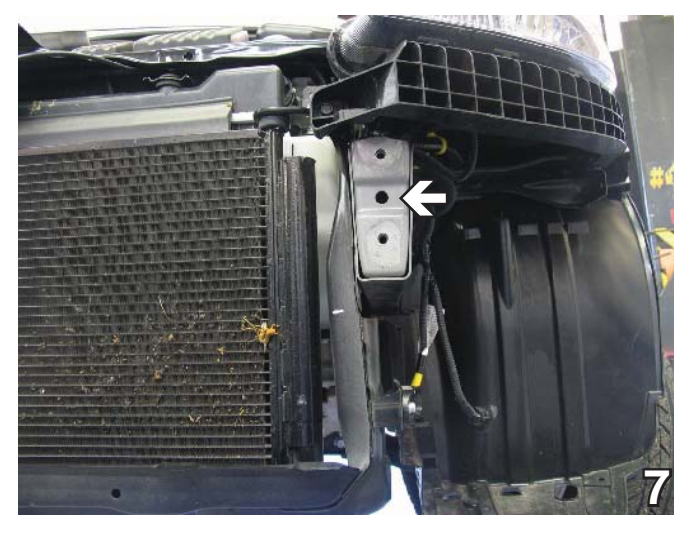
7. Using the 1 1/4" hole saw, ream out the center hole on the end of the frame rail. Do this to both sides of the vehicle.