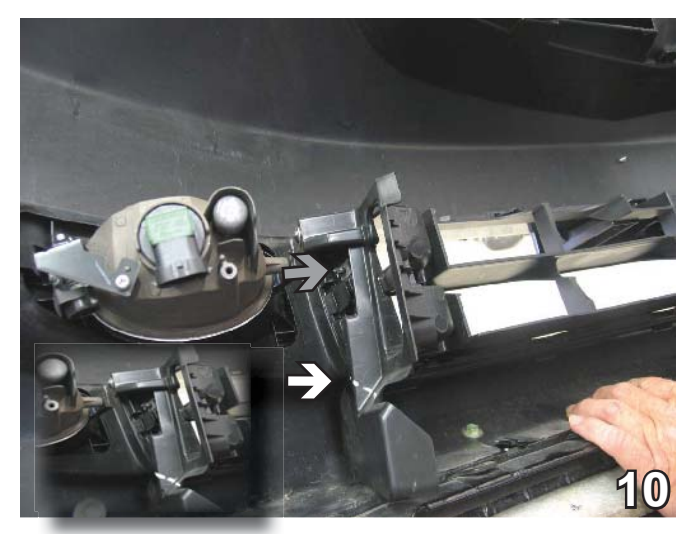
10. Lay fascia face down on a soft, non-marring surface. Using the utility knife, trim horizontally across the fascia support molding next to the grille (see white arrow). Remove one Phillips screw from the fascia support (see grey arrow). Remove upper portion of fascia support. Do this to both sides of the vehicle.