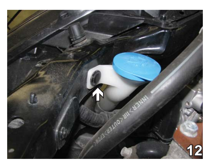
12. On the passenger side, remove the push pin by the washer reservoir fill lid. Set it aside to be reinstalled later.