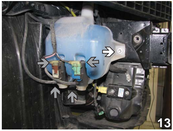
13. On the passenger side, unhook and plug the hoses and disconnect the electrical wires (gray arrows). Remove one bolt from the side of the metal bumper using the 10mm socket (white arrow). Set bolt aside to be reinstalled later.