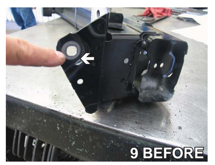
9. Flatten bumper bracket with a hammer.

8. With the bottom of the metal bumper face up, mark the back of bumper bracket webbing so it is flush with the bottom edge of bumper. Using the reciprocating saw, cut the marked area to remove lower webbing. Do this to both sides of the vehicle.