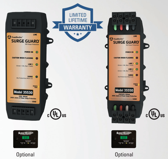
Total electrical protection from faulty park power.