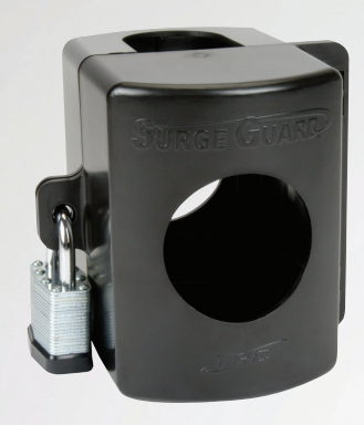
Lock not included